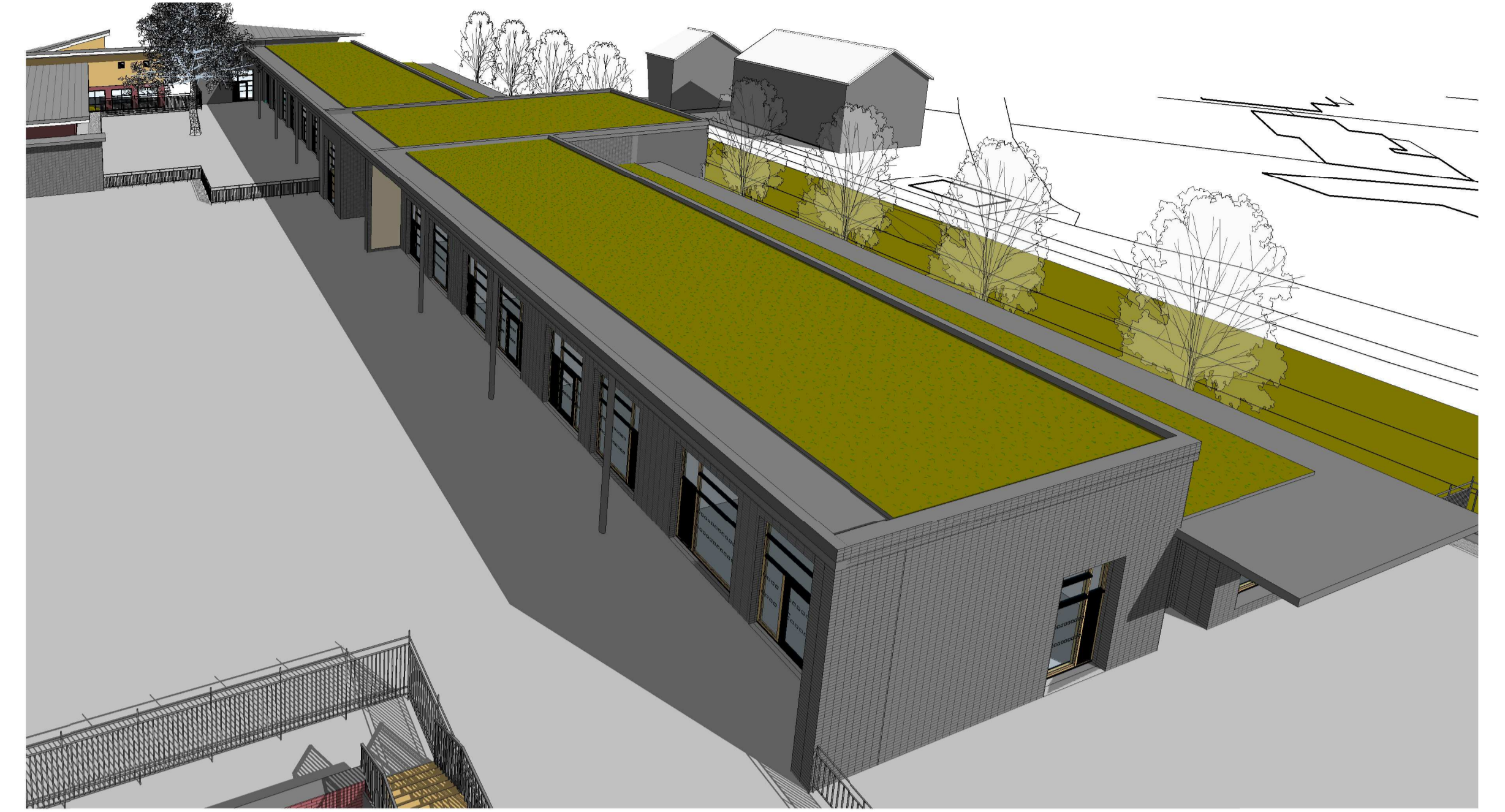
3 Aerial View from the South