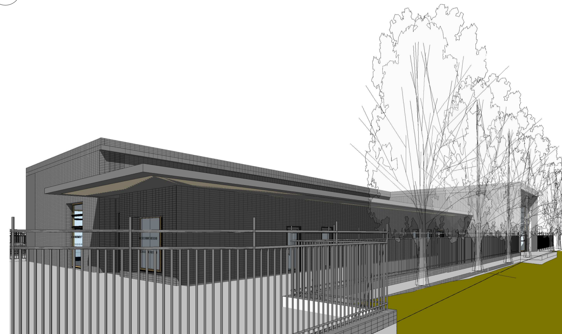
6 View from South East Corner