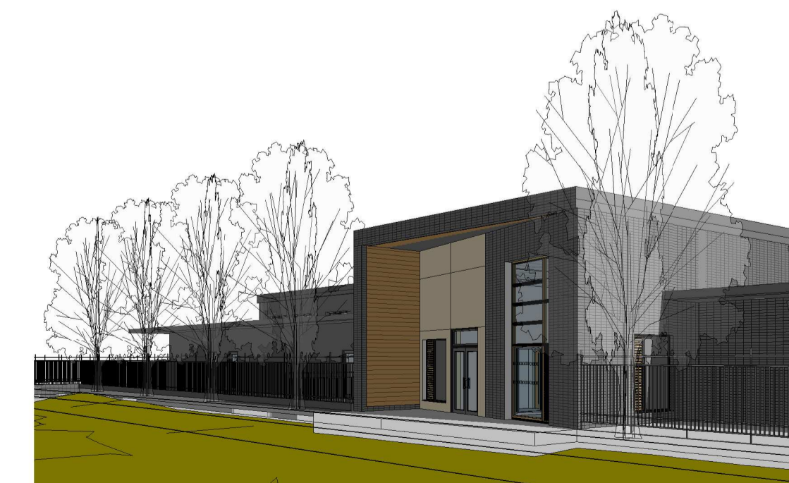
8 Main Entrance North East View