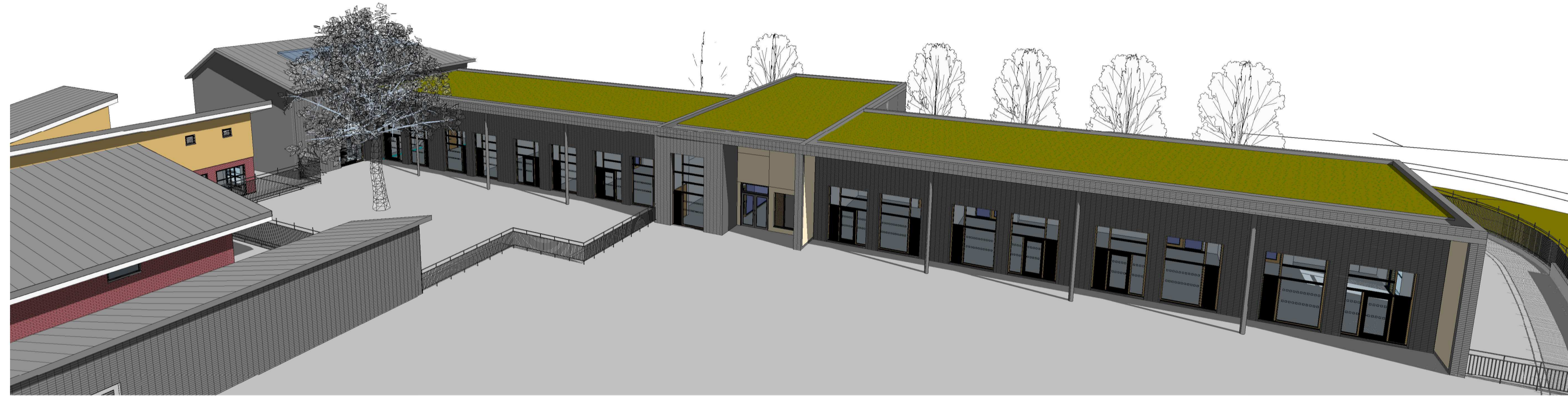
4 Aerial View from the South West