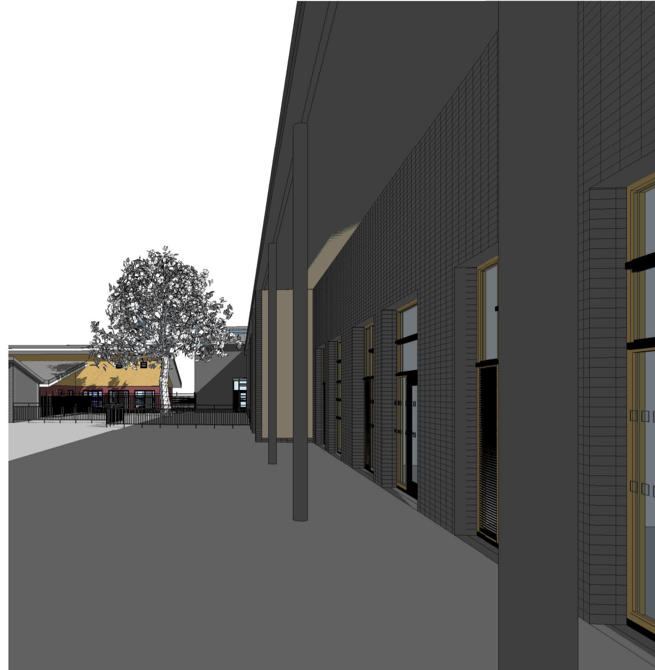
1 External Classroom Space