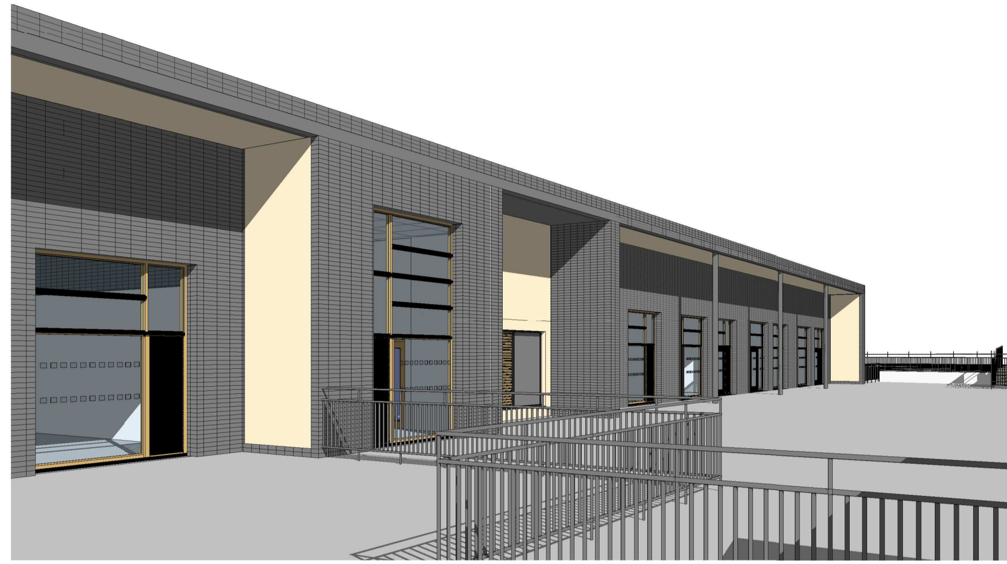
2 View from North West